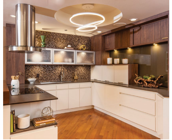
1ST PLACE NKBA AND CRYSTAL CABINETS CHOICE AWARD FOR A SHOWROOM DISPLAY Chelsey Preus - CK+B Display